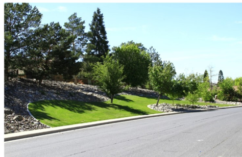
Xeriscape landscape at Essex Manor

"MTW is currently the only HUD program through which public housing authorities can wholly transform their operations, programs and housing.