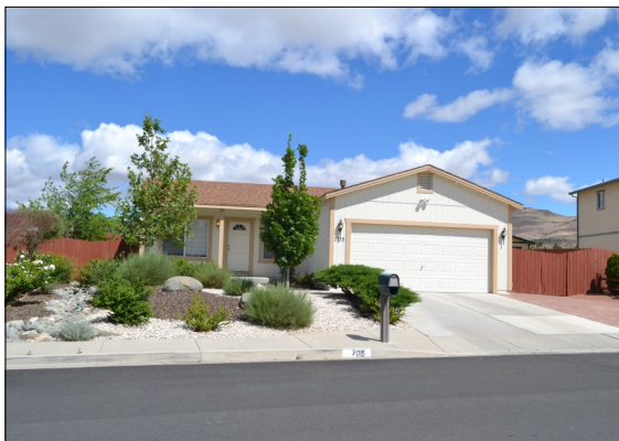
Pictured left are two of RHA's expanded housing opportunity properties. Dozens of single family homes were purchased through HUD's Neighborhood Stabilization Program in low-poverty areas in the Truckee Meadows.